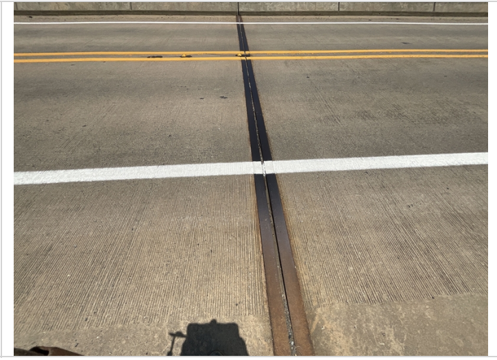
Bent 4 joint