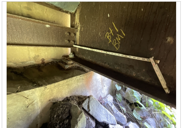
Corrosion at bent 1 beam 1