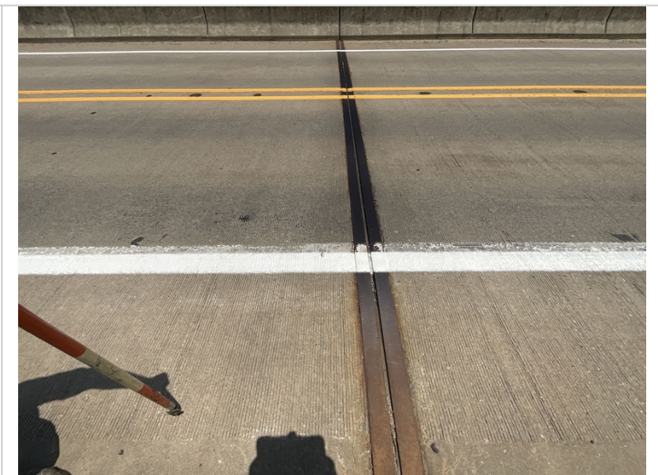
Bent 6 joint