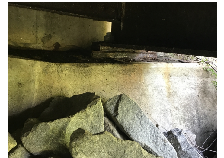
Laminating rust on bearing 1 at bent 1