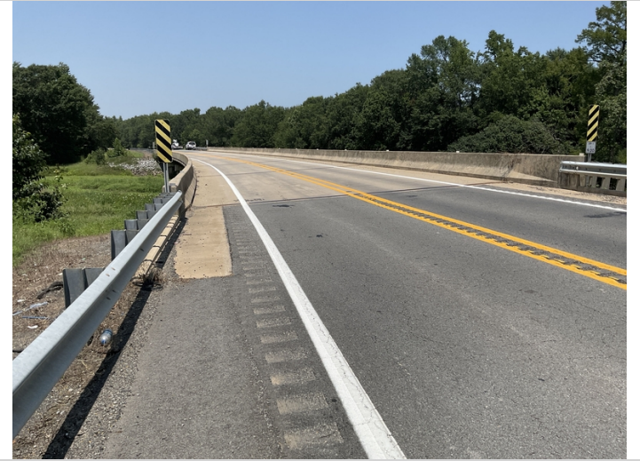
Approach looking north