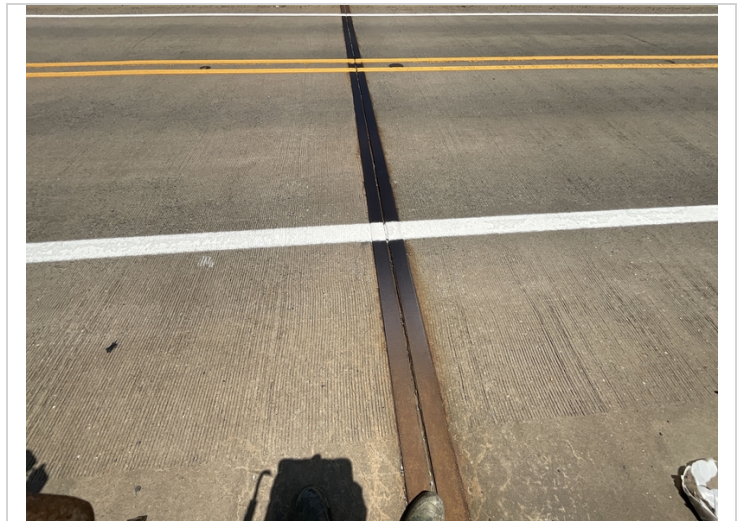
Bent 3 joint