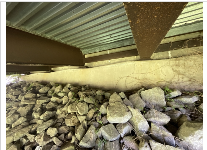
Bent 7 abutment vertical cracks with efflorescence