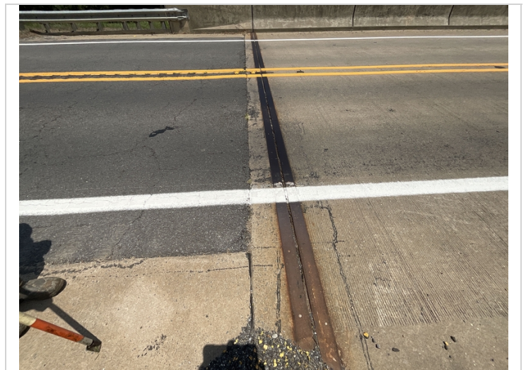
Bent 7 joint