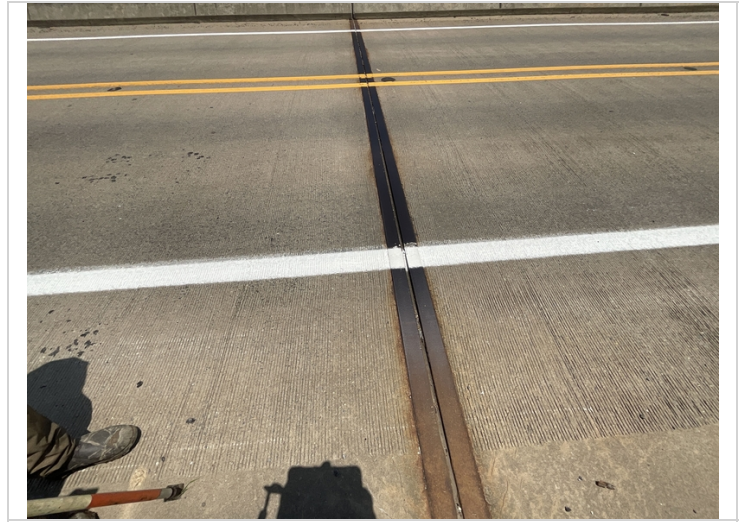
Bent 5 joint