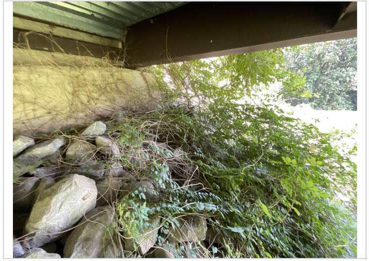
Vines growing at abutments