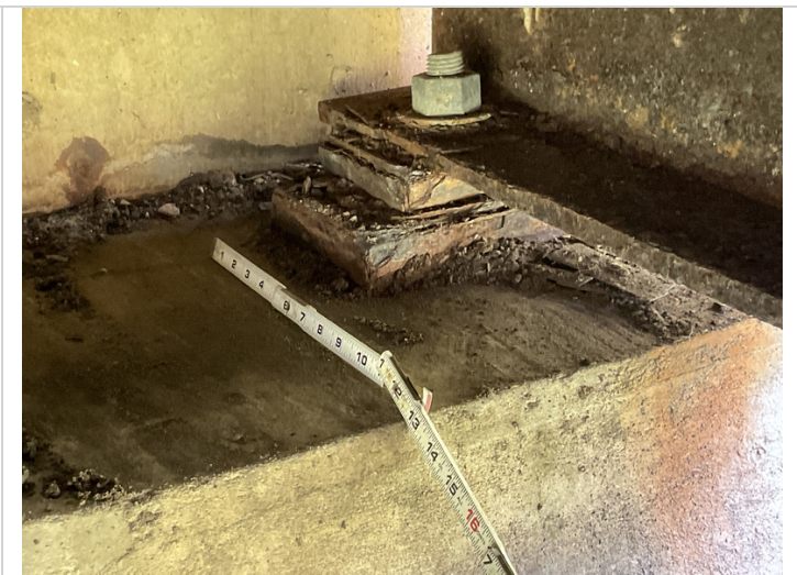
Bent 1 beam 1 bearing