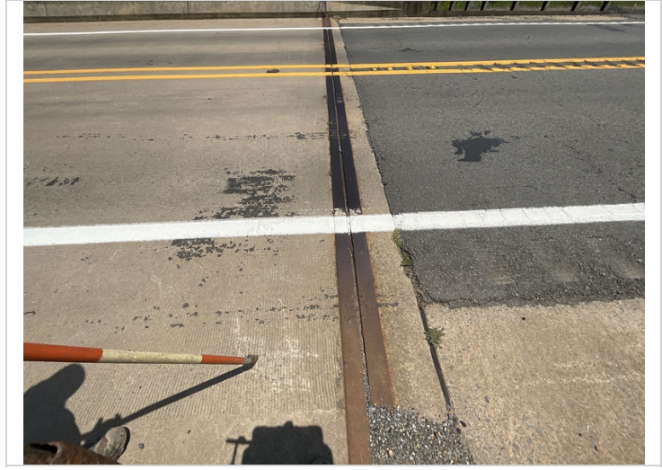
Bent 1 joint