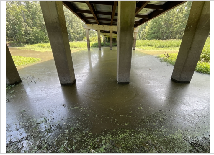
Abrasion to bottom of piles