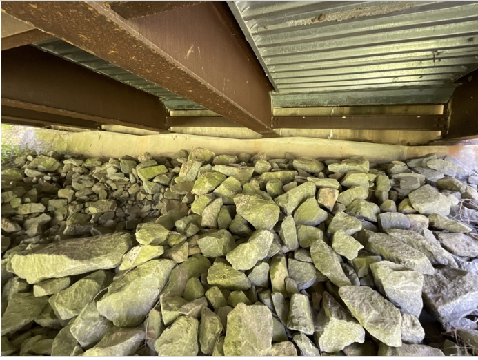
Bent 1 abutment