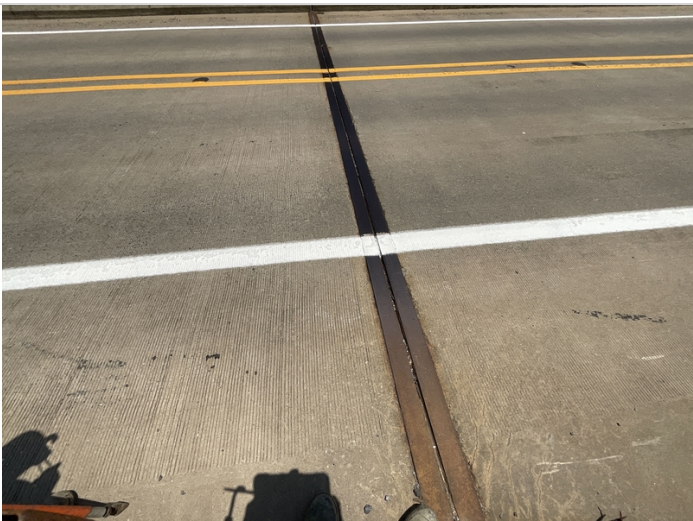
Bent 2 joint